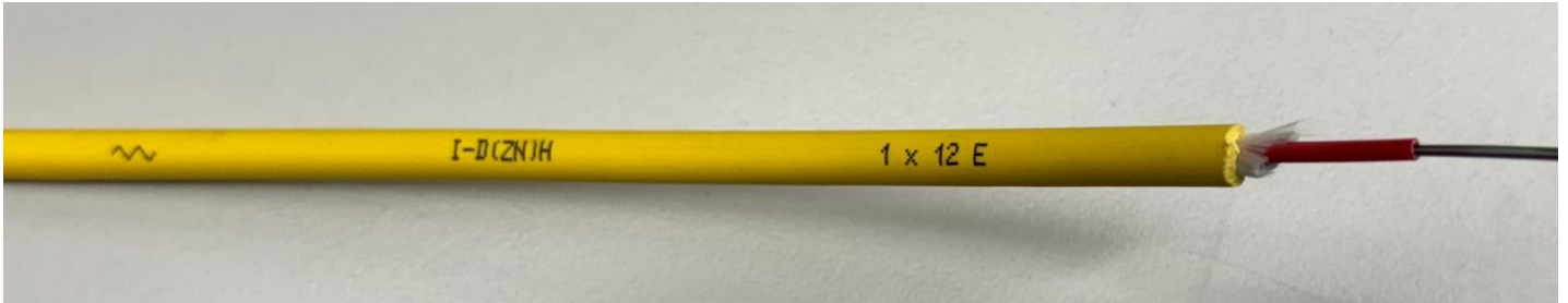
Image 2: Suitable internal connection cable for optical fiber lines as an example (“IVK”)

To provide a suitable internal connection cable (“IVK”) for optical fiber lines , please see below for an illustration of the correct cable :